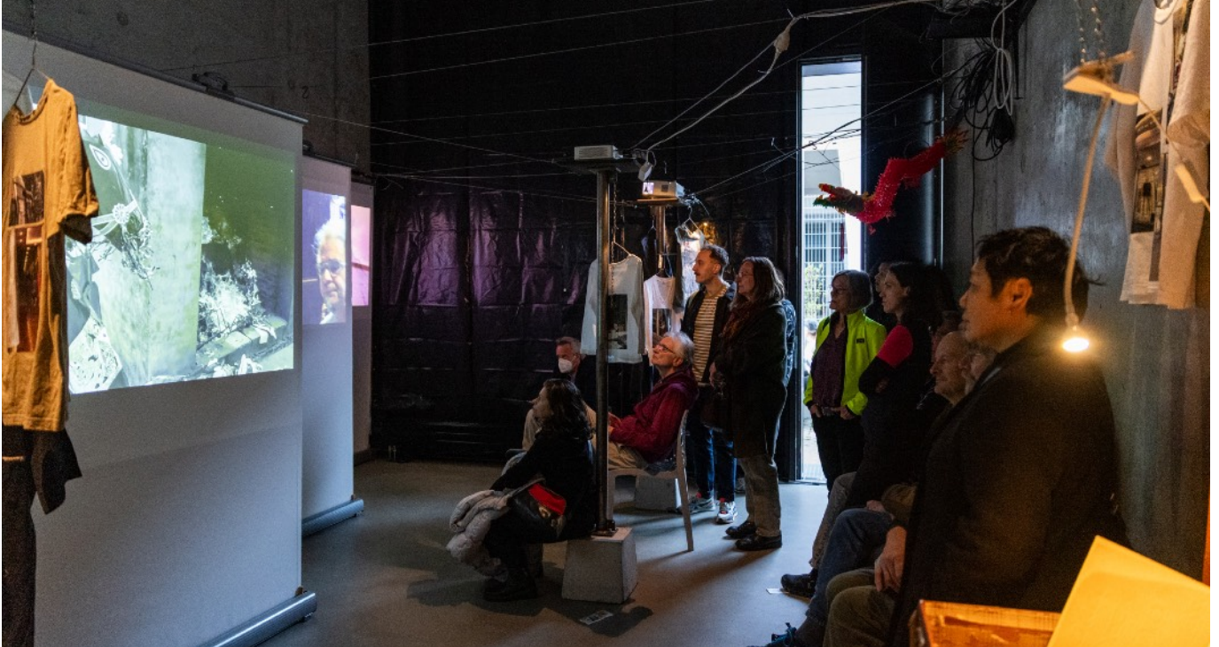
Exhibition at roam projects e.V., 4.4. - 1.5.2025